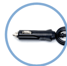
Cigarette Lighter Adapter